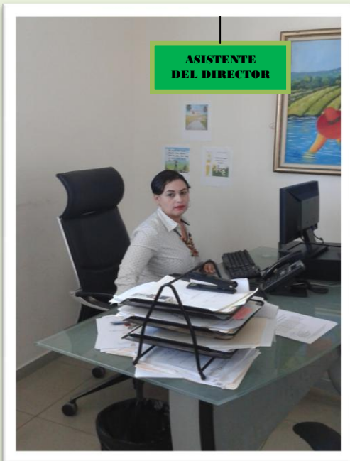
ASISTENTE DEL DIRECTOR